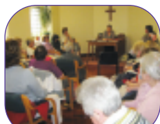
OWN members attended a presentation by Vantastic

Vantastic and Northside Legal Advice made presentations to network members which were attended by a total of over 100 members at the Methodist Hall in Abbey Street, Dublin.