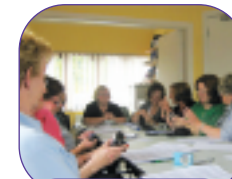
OWN members from Cork take part in a digital photography course as part of the EWM Course