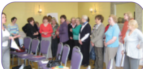
OWN Cavan & Dublin Members taking part in a workshop in preparation for the Womens Right to Health Shadow Report

women as part of the Women's Right to Health shadow Report which was presented to government.