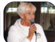
Cork member sings 'On the banks of my own lovely Lee' - International Women's Day