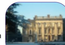
All Halls Winter 2010

Sincere and grateful thanks for the wisdom and expertise they have brought to OWN.