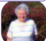
Maire Uí Bhraoin