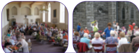
OWN Annual Garden Party 2010