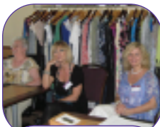
Oxendales Staff provide EWM course participants from Cavan with personal grooming tips & advice