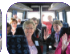
OWN members from Cavan attend DCU event