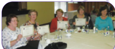
Galway members with their EWM Certs

Rural and Gaeltacht Affairs had been cut a further 14%. This obviously necessitated a major adjustment to the OWN budget for 2010. The employer's contribution to the staff pension fund was reduced and CEO staff hours reduced to a 20 hour week. At last year's AGM, the members agreed to the suggestion in the Strategic Plan to pay for meals at all events during the year (with the exception of the Garden Party).