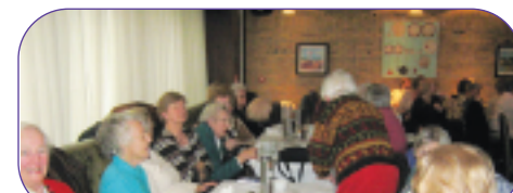
OWN Members from all over the country meet in Cork for International Women's Day